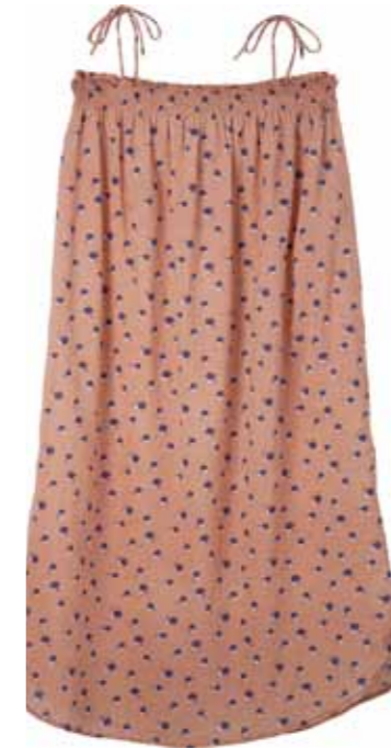
FOREST MAZE / DR-562