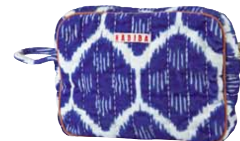
JAPAN BLUE / VELOUR