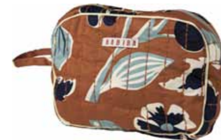
RUST / SATIN