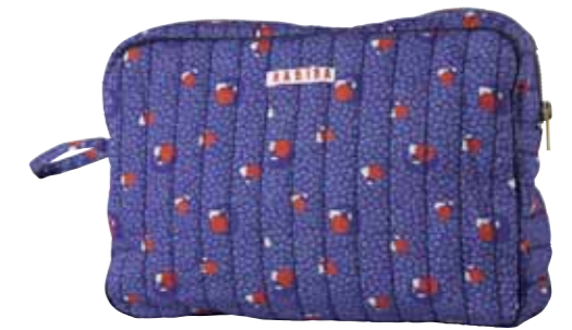
JAPAN BLUE / SATIN