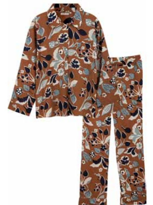
RUST (ONLY S/M-M/L)