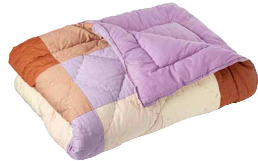
OLGA / BC-203