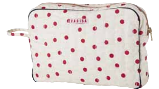
KISS / SATIN