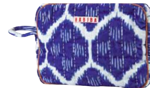
JAPAN BLUE / VELOUR