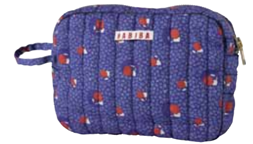
JAPAN BLUE / SATIN