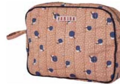
TILE / VOILE