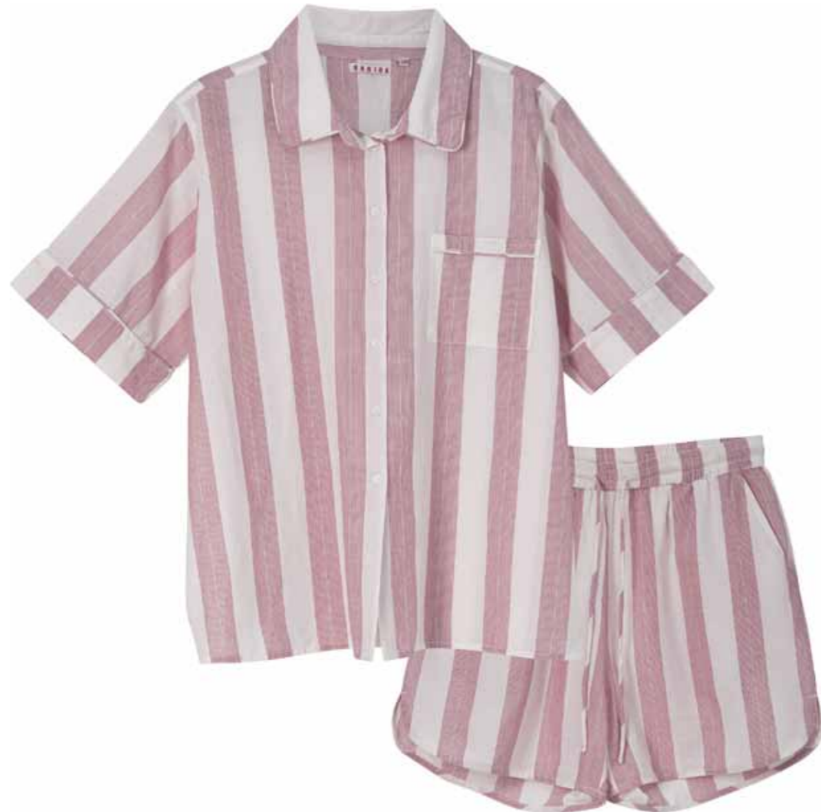
PIN STRIPE / SA-101