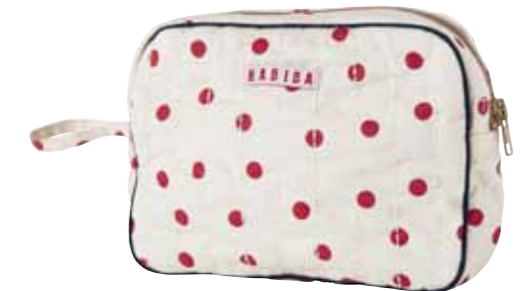
KISS / SATIN