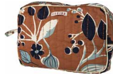
RUST / SATIN