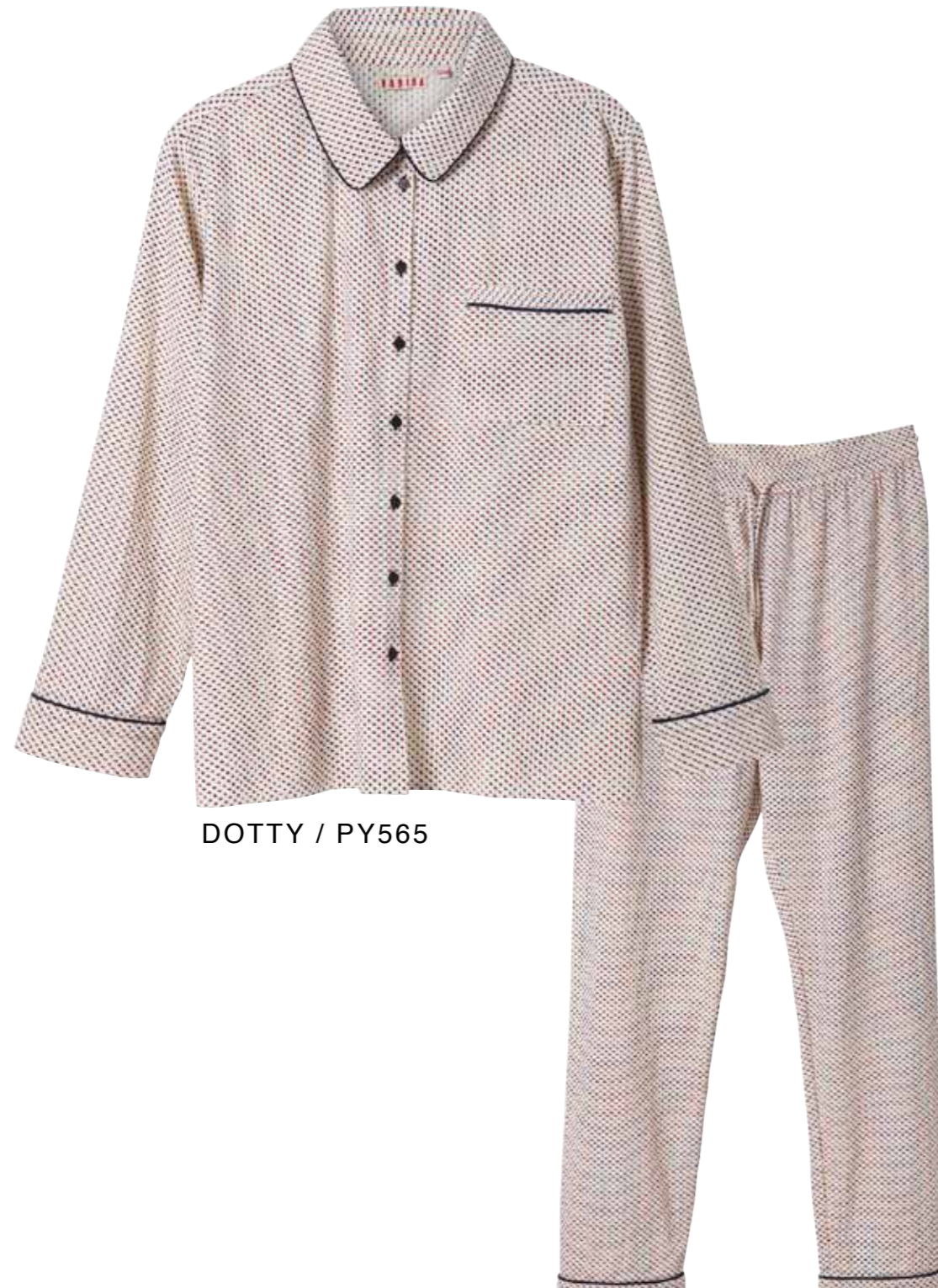
DOTTY / PY565

SAFARI SET, SHIRT, DRESS S/M - M/L PYJAMAS SET S/M - M/L - L/XL