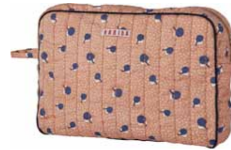
TILE / VOILE