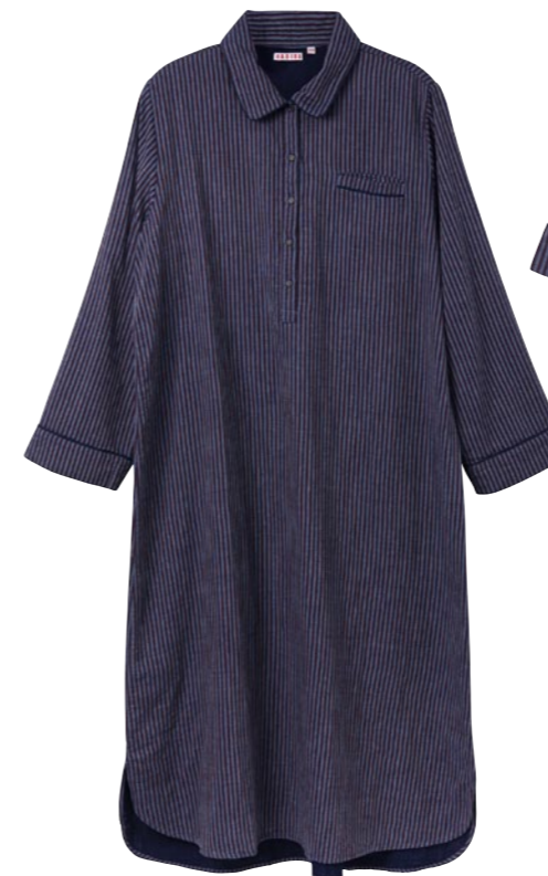
LONG SHIRT / SH-566