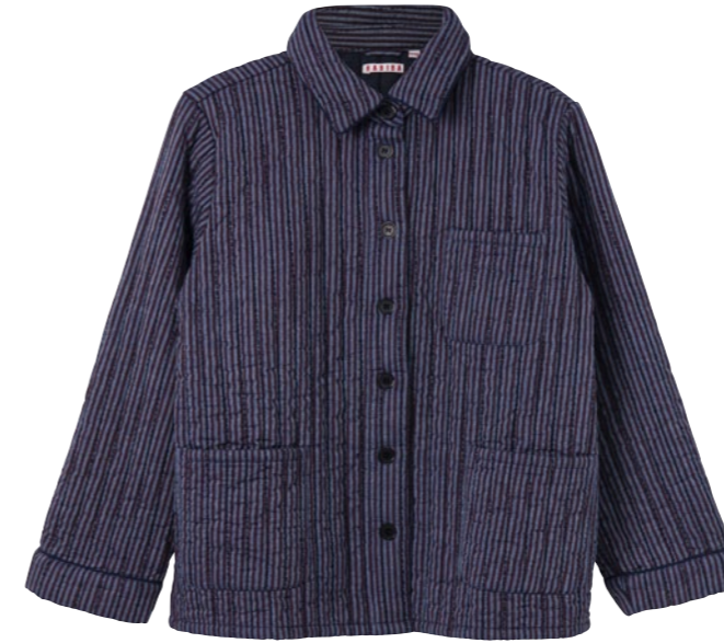
QUILTED JACKET / JQ-108