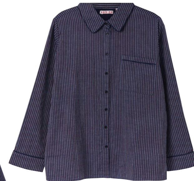
CLASSIC SHIRT / SH-101