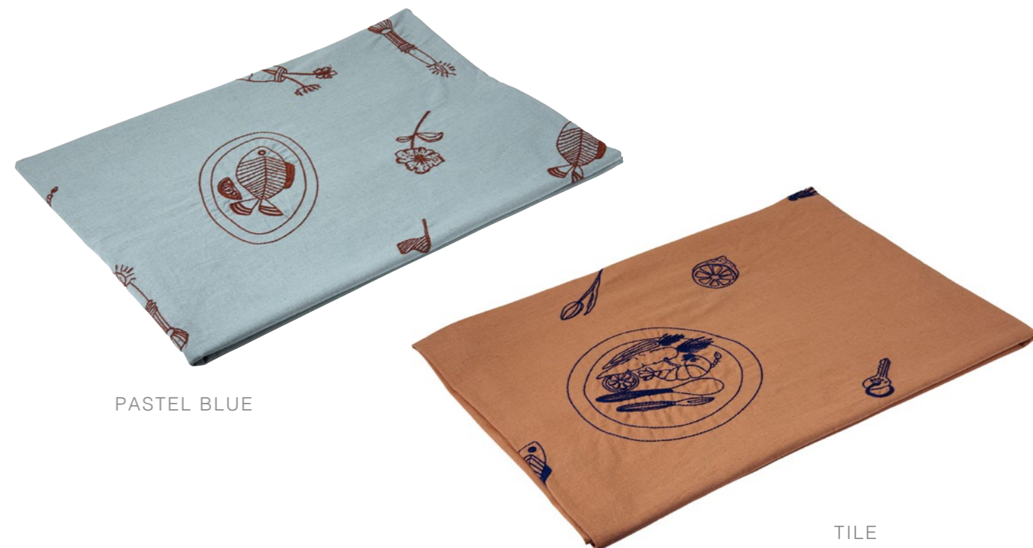
TABLE CLOTH 140x250 CM / TC-101