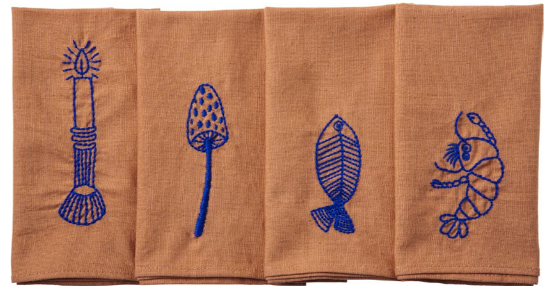
TABLE NAPKINS - 4 PCS SET / TN-101 40x40 CM